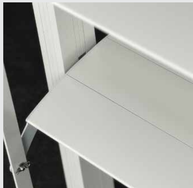
Elliptical design louver with adjustable incline