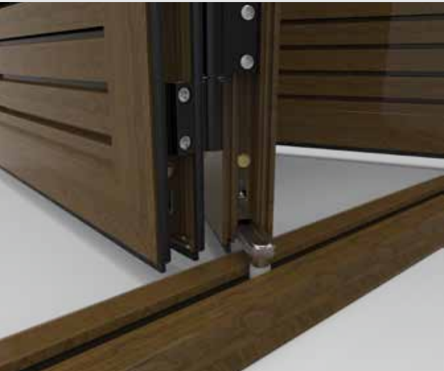
Bottom sash guide roller for smooth movement.